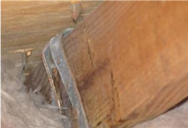
Roof to Wall Connection - Double Straps