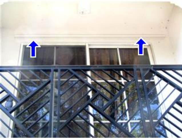
Hurricane Shutter Hardware - Glass Doors