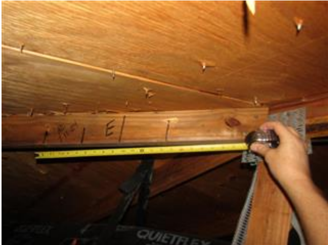
Roof to Deck Connection