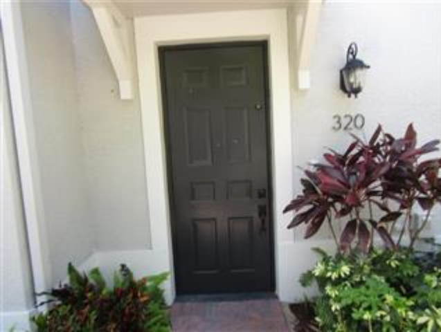
Hurricane Solid Doors