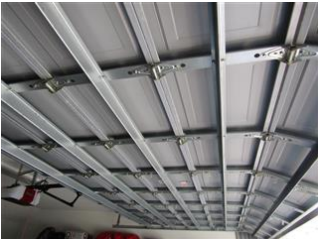
Hurricane Garage Door