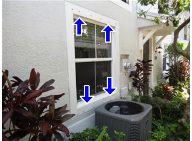
Hurricane Shutter Hardware - Windows