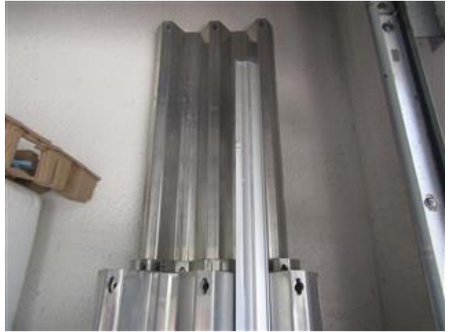
Hurricane Impact Shutters