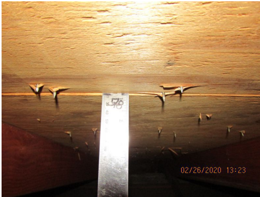
5/8" Deck Thickness Confirmed