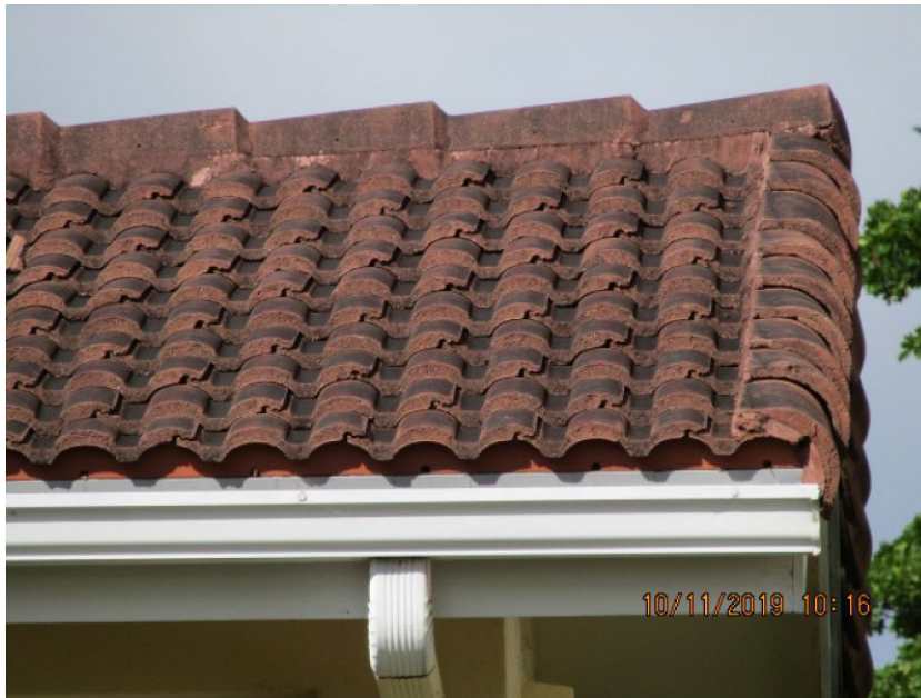
Concrete/Clay Tile Roof Covering