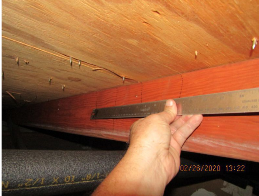
8d Nails or Greater in Size Spaced 6" Along the Edge