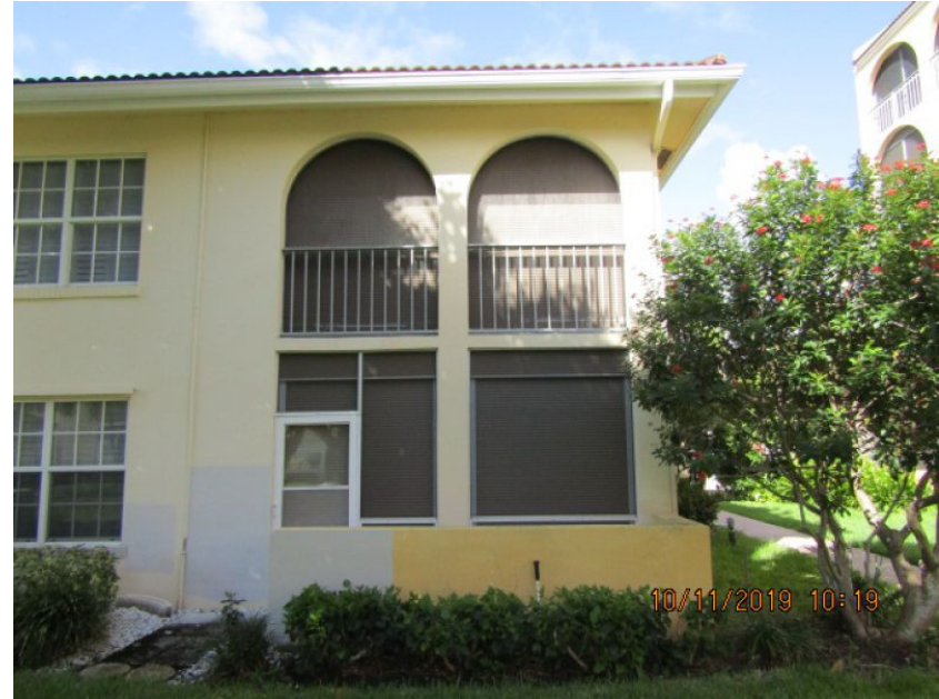
Non-Rated Roll-down Shutters