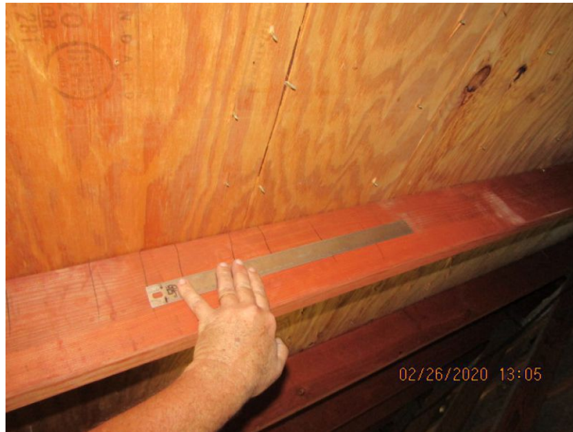
8d Nails or Greater in Size Spaced 6" Along the Edge