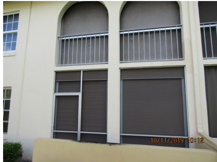
Non-Impact Rated Roll Down Shutter