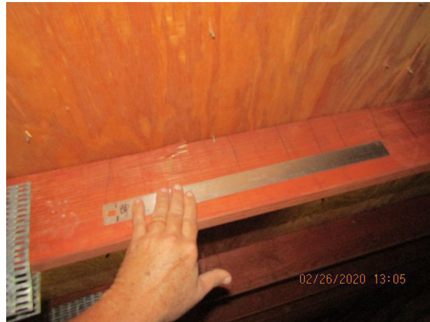
8d Nails or Greater in Size Spaced 6" in the Field