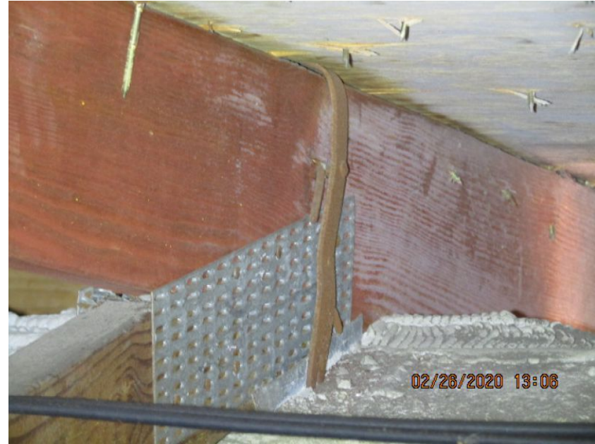
Metal Connector with 1 Nail on the Front Side & 2 Nails on the Opposing Side