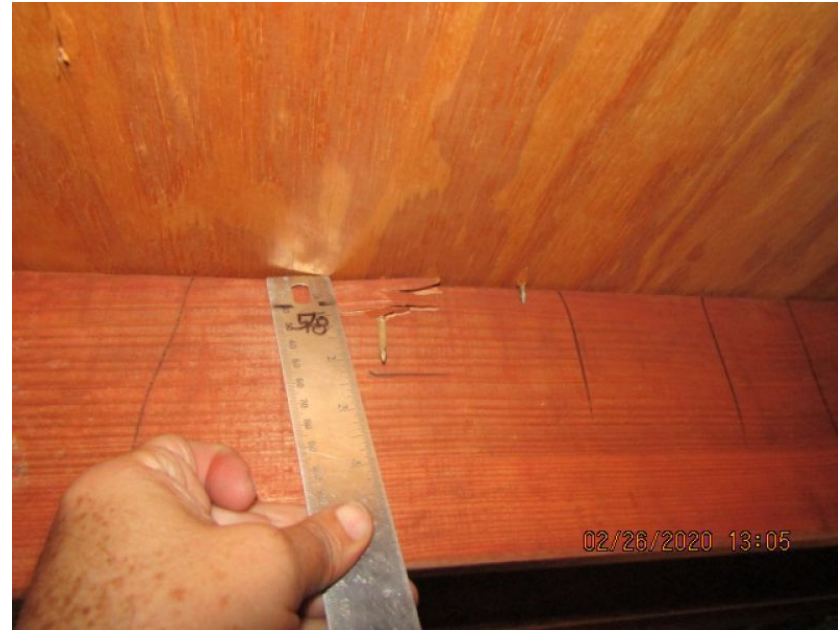
8d Nails or Greater in Size