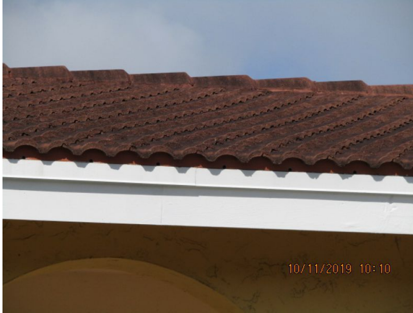
Concrete/Clay Tile Roof Covering