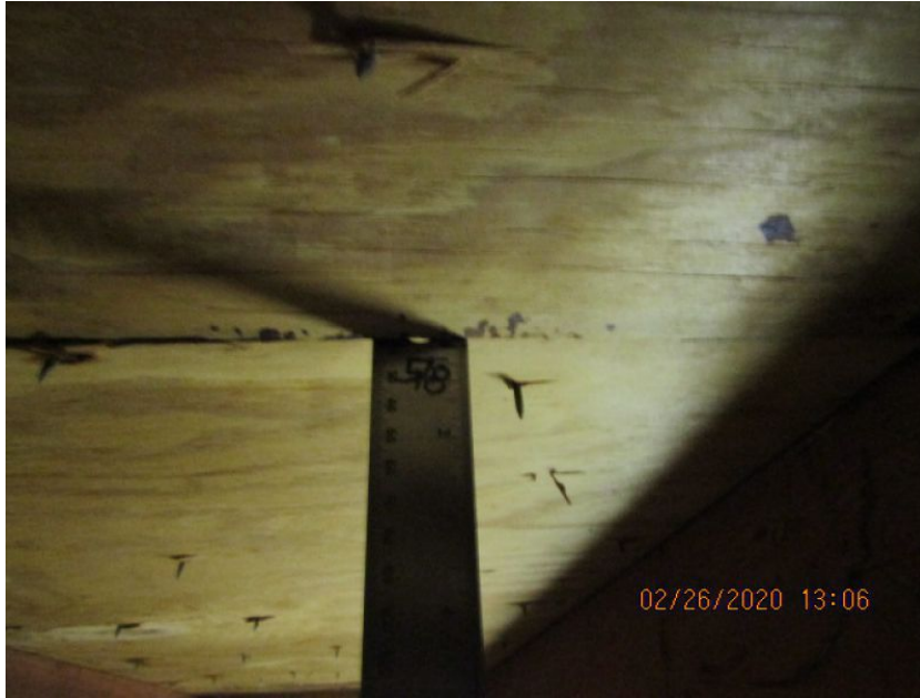
5/8" Deck Thickness Confirmed