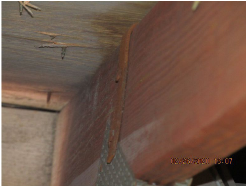
Metal Connector with 1 Nail on the Front Side & 2 Nails on the Opposing Side