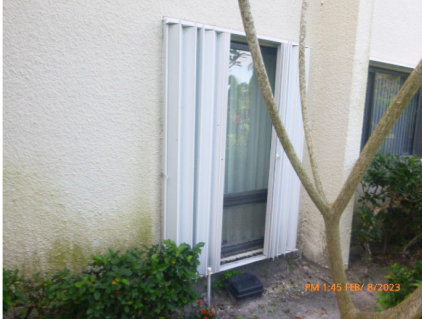
Impact Rated Accordion Shutter