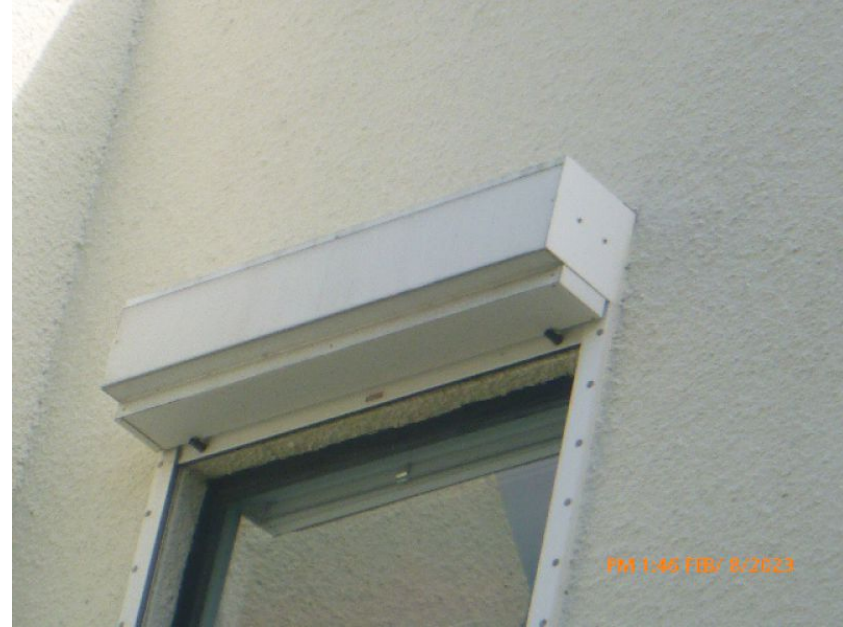
Non-Impact Rated Roll Down Shutter