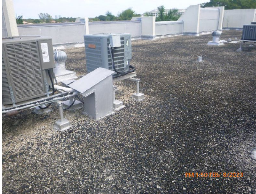
Structural: Reinforced Concrete