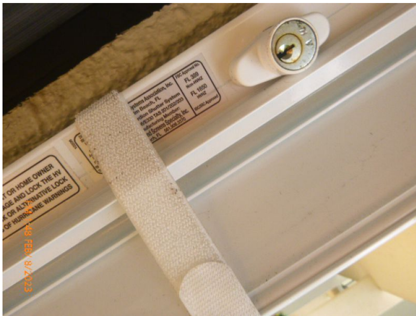
Impact Rated Accordion Shutter Label