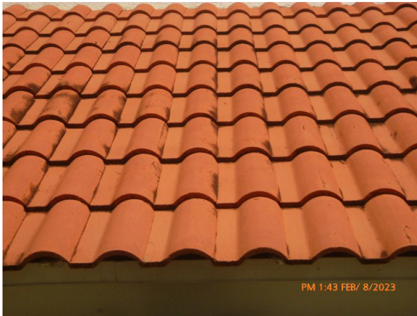
Concrete/Clay Tile Roof Covering