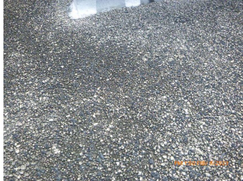
Built Up/Rolled Asphalt (Flat) Roof Covering