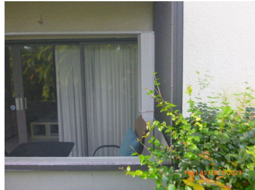
Impact Rated Accordion Shutter